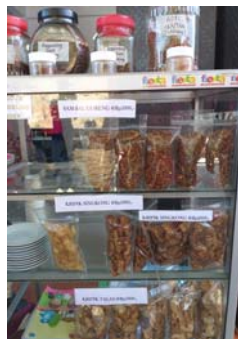
Member's Produk marketed in Tokina